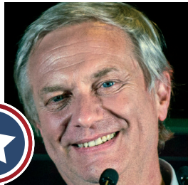
José Antonio Kast, 55