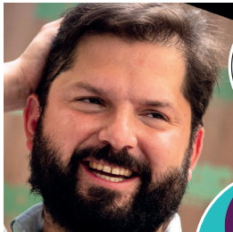
Gabriel Boric, 35

Voters in Chile head to the polls in a presidential run-off in which two candidates offer completely opposing visions for the country's future, after two years of street protests and political unrest