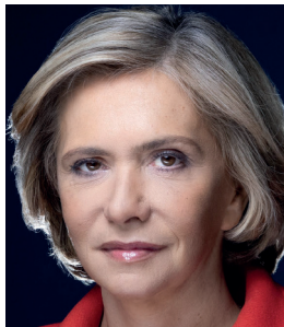
Valérie Pécresse, 54

Mayor of residential Paris suburb and head of emergency ward at top hospital. Gained prominence during Covid-19 crisis, pledges to revitalise public services