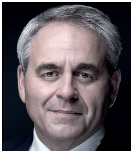
Xavier Bertrand, 56

Former health minister under Nicolas Sarkozy , now head of industrial Hauts-de-France region. Polls show moderate right-winger is best-placed to unseat Macron