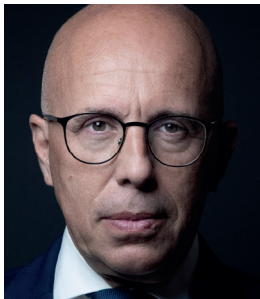
Éric Ciotti, 56

EU's former Brexit negotiator. Betting that party loyalty will endear him to activists but lacklustre showing in TV debates may harm his chances