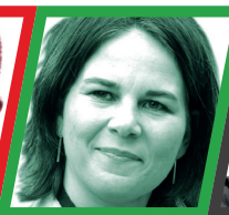
Annalena Baerbock Greens