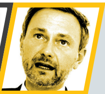
Christian Lindner Free Democratic Party (FDP)

Predicted vote share in Sep 26 election†