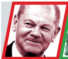
Olaf Scholz Social Democratic Party (SPD)

As German voters prepare to choose chancellor Angela Merkel's successor, polls suggest the Social Democrats' candidate Olaf Scholz has built a commanding lead ahead of election day