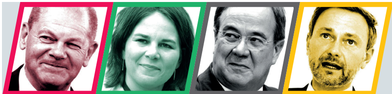
Olaf Scholz Social Democratic Party (SPD)

Polls suggest five parties stand a chance of playing a role in government, with only the far-right Alternative for Germany shut out