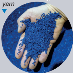
Polypropylene fibres before extruded into yarn

ARMATURE: Steel trusses installed in front of statues, cornices and ornaments to protect and highlight shape of landmark while wrapped