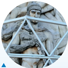
Steel cage surrounding one group of statues

The Parisian monument is set to be wrapped in lustrous fabric as part of a posthumous installation by Bulgarian-born artist Christo