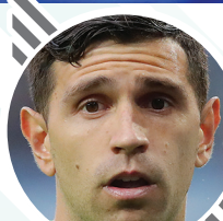
Emiliano Martinez Aston Villa