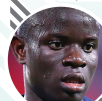
N'Golo Kanté Chelsea