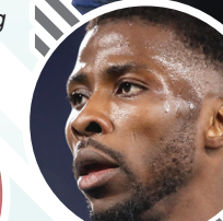
Kelechi Iheanacho Leicester City