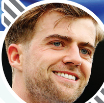
Patrick Bamford Leeds Utd