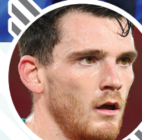
Andrew Robertson Liverpool