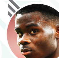
Bukayo Saka Arsenal