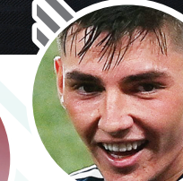
Billy Gilmour Norwich City