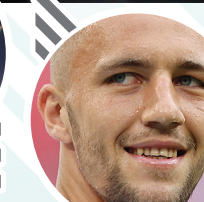
Tomás Soucek West Ham