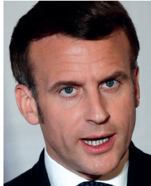
French president Emmanuel Macron

■ May 30-Jun 2: West African regional bloc ECOWAS and African Union suspend Mali's membership