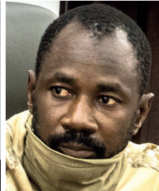
Colonel Assimi Goïta