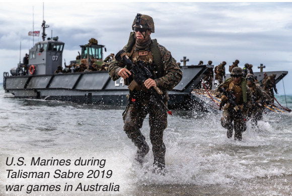
U.S. Marines during Talisman Sabre 2019 war games in Australia

More than 2,000 U.S. Marines are already in northern Australia as part of annual joint training activities. Biennial Australia-U.S. war games typically involve more than 30,000 troops