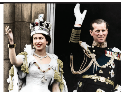
Coronation Day, Jun 2, 1953

■ 1956: Duke of Edinburgh's Award scheme launched – international programme aimed at helping young people engage in community service