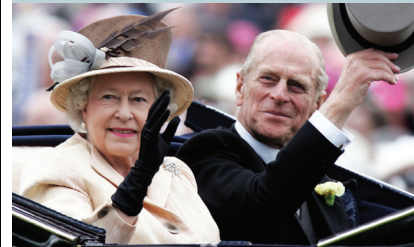
Queen and Duke at Royal Ascot, 2005

■ 1986: Known for his frequent gaffes, unfortunate remark to UK students about "slitty eyes" makes headlines on state visit to China