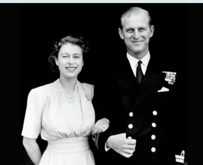
Engagement announced Jul 9, 1947

■ 1947: King George VI announces engagement of Princess Elizabeth to Lt. Philip Mountbatten . Philip renounces Greek and Danish titles, takes British citizenship and adopts his mother's anglicised name of Mountbatten