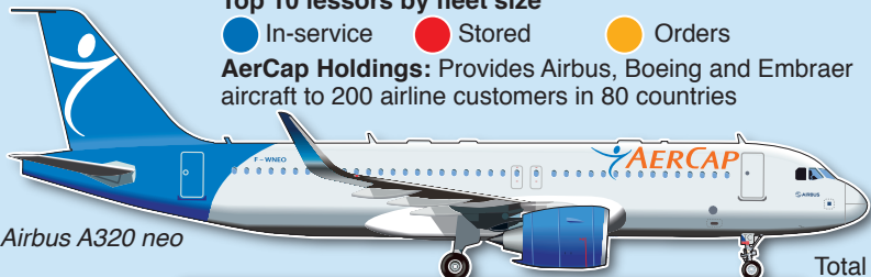
Airbus A320 neo

AerCap Holdings: Provides Airbus, Boeing and Embraer aircraft to 200 airline customers in 80 countries