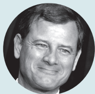
John Roberts Chief Justice, U.S. Supreme Court

The second impeachment trial of former President Donald Trump bears similarities to last year's, with the crucial difference that he is the first to be tried by the Senate after leaving office