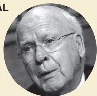
Patrick Leahy Longest-serving Democrat senator