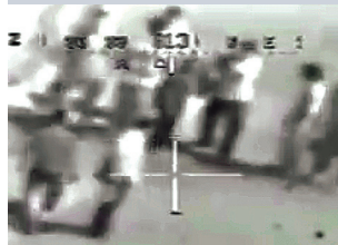
Leaked U.S. helicopter footage of 2007 Baghdad airstrike that killed two Reuters journalists

■ Dec 10: Senior judges quash lower judge's ruling, after U.S. says Assange would not be put in solitary confinement – reducing risk of suicide