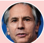
Secretary of State Antony Blinken