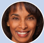
Chair of Council of Economic Advisers Cecilia Rouse