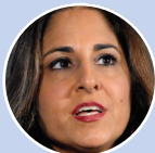
Office of Management and Budget Neera Tanden