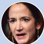
Director of National Intelligence Avril Haines