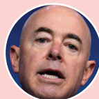
Homeland Security Alejandro Mayorkas