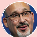
Education Miguel Cardona