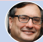
Chief of Staff Ron Klain