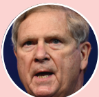
Agriculture Tom Vilsack