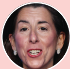
Commerce Gina Raimondo