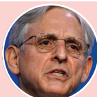
Attorney General Merrick Garland