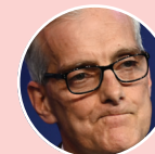
Veterans Affairs Denis McDonough