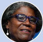
Ambassador to UN Linda Thomas-Greenfield