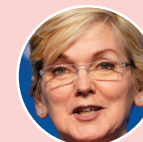
Energy Jennifer Granholm