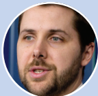
National Economic Council Director Brian Deese