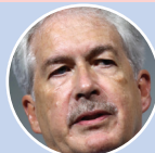
CIA Director William Burns