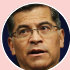
Health and Human Services Xavier Becerra