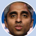
Surgeon General Vivek Murthy