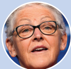
Domestic Climate Policy Coordinator Gina McCarthy