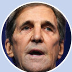
Special Presidential Envoy for Climate John Kerry