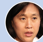
U.S. Trade Representative Katherine Tai