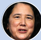
Small Business Administrator Isabel Guzman