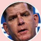
Labour Marty Walsh