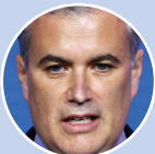
Coronavirus Coordinator Jeff Zients