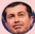
Transportation Pete Buttigieg