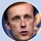
National Security Adviser Jake Sullivan