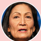
Interior Deb Haaland