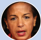
Domestic Policy Council Director Susan Rice