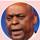
Defence Gen. Lloyd Austin