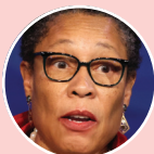
Housing and Urban Development Marcia Fudge