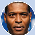
EPA Administrator Michael Regan