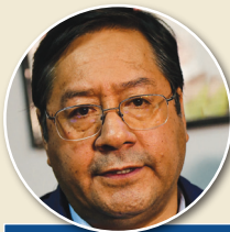
Luis Arce, 57 Leftist heir to former president Evo Morales

Bolivia's Socialists look set to return to power after exit polls showed them on course to win a majority in the presidential election