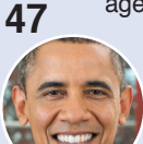
47 Barack Obama 2009