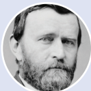
46 (+311 days) Ulysses S. Grant 1869