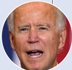
78 Joe Biden Would become oldest president if inaugurated in 2021