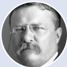
Theodore Roosevelt 1901 Youngest to assume presidency