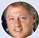
46 (+154 days) Bill Clinton 1993