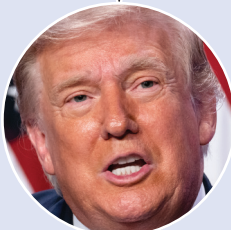
70 Donald Trump 2017 Oldest ever U.S. president to enter office