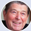
Ronald Reagan 1981 Oldest serving U.S. president, aged 77 when he left office in 1989