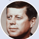
John F. Kennedy 1961 Youngest elected president