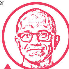
Microsoft CEO Satya Nadella is seeking to buy TikTok