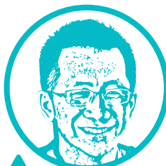
ByteDance founder and CEO Zhang Yiming

● Aug 2018: TikTok absorbs Musical.ly to create larger video community, consolidating accounts and data into one app. Launches worldwide, including in U.S.