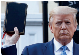
photo-op at St. John's Church

■ Jun 5: Trump cuts U.S. troop levels in Germany, blindsiding Pentagon officials and European leaders