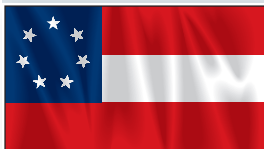
Stars and Bars 1861-63. Extra stars added as more states joined confederacy

“REAL” CONFEDERATE FLAG: Confederate States of America – states that supported slave ownership and wanted to secede from United States – used three different flags during 1861-65 Civil War