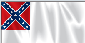
Stainless Banner 1863-65. Incorporated battle flag as canton on white field