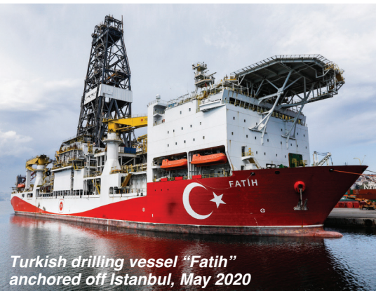
Turkish drilling vessel "Fatih" anchored off Istanbul, May 2020

Turkey is planning to drill for oil and gas in areas of the Mediterranean Sea that Greece considers its own, setting the stage for a potential confrontation between the two NATO allies