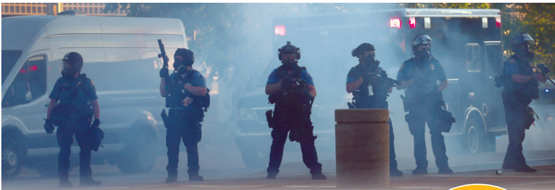
NUMBER OF PEOPLE KILLED BY POLICE IN U.S.*

The number of police killings in the United States has hovered around 1,100 every year since 2013 – equal to about three people per day – according to Mapping Police Violence, a research and advocacy group