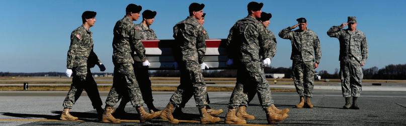
AFGHANISTAN FATALITIES BY YEAR (2001-2020)

A truce agreement between the United States and the Taliban could lead to the withdrawal of American troops from Afghanistan. Almost 2,500 U.S. service members have died in the Afghan war, now in its 19th year