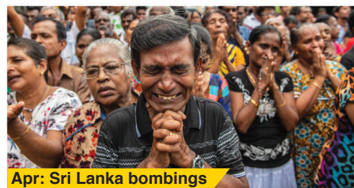
Apr: Sri Lanka bombings