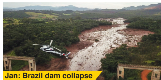
Jan: Brazil dam collapse