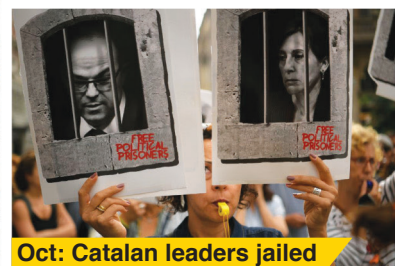
Oct: Catalan leaders jailed