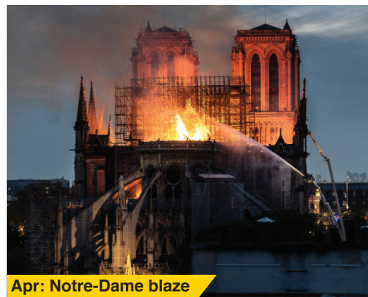
Apr: Notre-Dame blaze