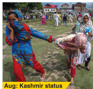
Aug: Kashmir status