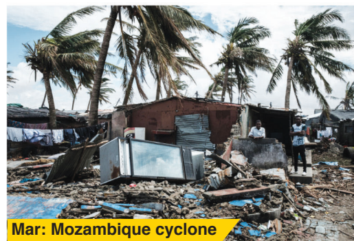
Mar: Mozambique cyclone