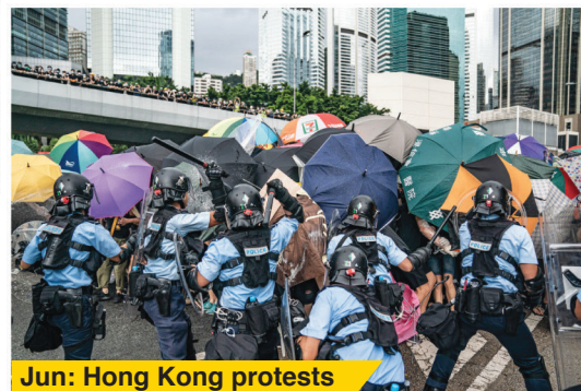
Jun: Hong Kong protests