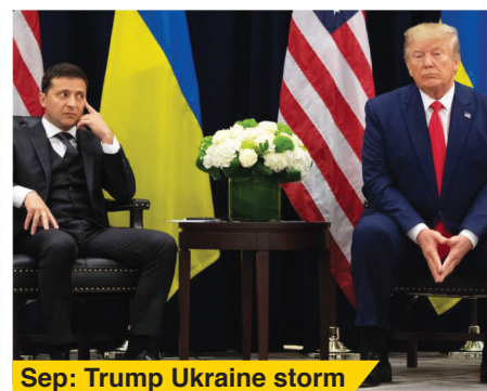
Sep: Trump Ukraine storm