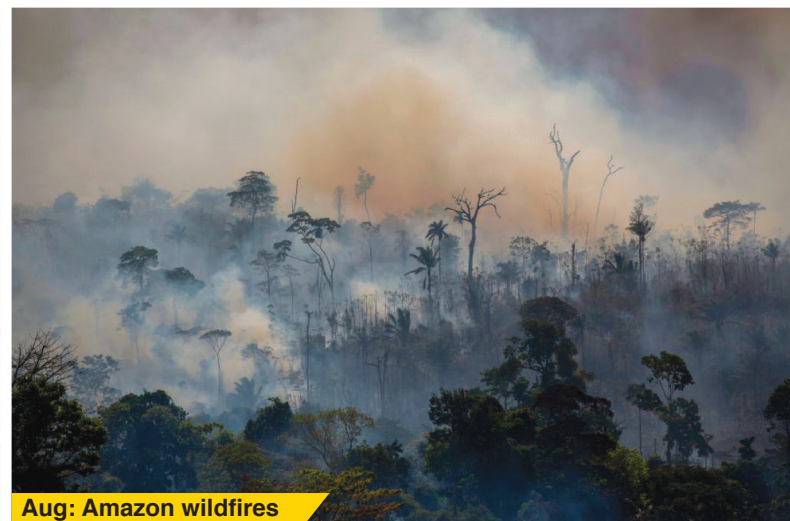
Aug: Amazon wildfires