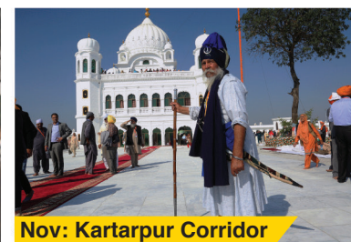
Nov: Kartarpur Corridor