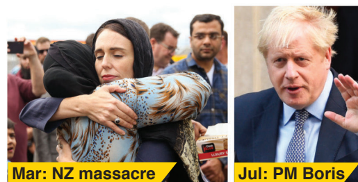
Mar: NZ massacre