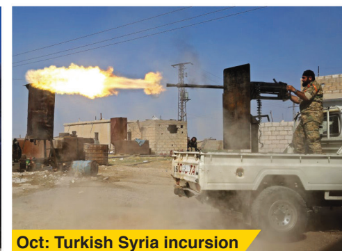
Oct: Turkish Syria incursion

JAN 1 NASA's New Horizons probe makes a successful flyby of Ultima Thule, in the Kuiper belt, the most distant object yet visited by a spacecraft