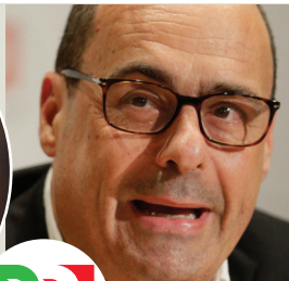
Nicola Zingaretti Democratic Party (PD)