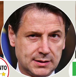
Giuseppe Conte Independent