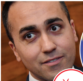
Luigi Di Maio 5-Star Movement (M5S)

Italy's ruling 5-Star Movement and the opposition Democratic Party are close to a deal to form a new government that will reinstate Giuseppe Conte as prime minister