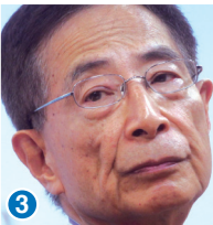
2 Jimmy Lai, 71

Media tycoon who founded Next Media – Hong Kong-based media company which publishes Next Magazine and popular pro-democracy Apple Daily newspaper. Lai, who launched fashion brand Giordano in 1981, says Tiananmen Square massacre spurred him to switch from garment business to newspapers