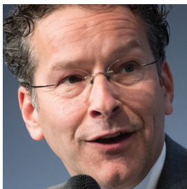
Jeroen Dijsselbloem Former Dutch finance minister

The search for a European candidate to replace Christine Lagarde at the helm of the International Monetary Fund has narrowed down to three candidates ahead of a September 6 deadline