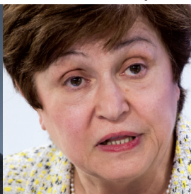
Kristalina Georgieva Bulgarian chief executive of World Bank

Ex-head of Eurogroup would have to overcome doubts in southern Europe about his economic approach