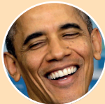
President Barack Obama

2015-16 investment boom: Biggest recipients of Chinese FDI are real estate, financial services, information and communications technology (ICT), autos, health, biotech and entertainment