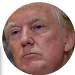
President Donald Trump

2018: President Trump starts trade war. Chinese investors dump $13bn worth of U.S. assets, $20bn in divestitures still pending