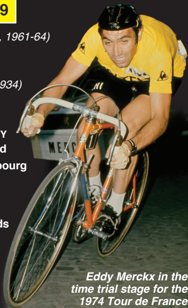
Eddy Merckx in the time trial stage for the 1974 Tour de France

Note: Lance Armstrong was stripped of his wins, having worn yellow jersey 83 times from 1999 to 2005. Source: The Official Encyclopedia of the Yellow Jersey.