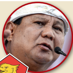
Member of Gerindra

PRESIDENTIAL RACE Incumbent Joko Widodo (left), former furniture salesman who ran on pro-poor platform in 2014, is standing for re-election against Prabowo Subianto , former military general he defeated in 2014