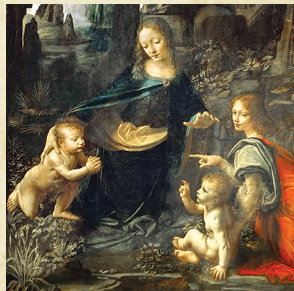
✦ 1486: Completes first of two versions of Virgin of the Rocks

✦ 1495: Mural of Last Supper (above) takes two years to complete, using experimental technique