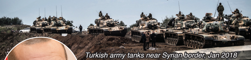
Turkish army tanks near Syrian border, Jan 2018

Turkish President Recep Tayyip Erdogan is threatening to launch a new offensive against U.S.-backed Kurdish fighters in Syria, a move likely to further strain ties between NATO allies Turkey and the United States