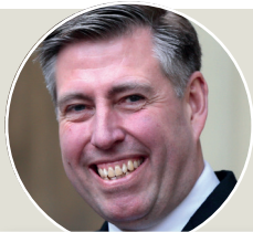
Sir Graham Brady

Tory backbench chief has received letters from 48 Conservative MPs – 15% – calling for no-confidence vote in Prime Minister Theresa May