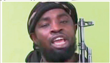
Abubakar Shekau ▲

Launched military operations in 2009 to create Islamic state – since then more than 20,000 people have been killed. Shekau continues to command militants under group's previous name, Jama'atu Ahlis Sunna Lidda'awati wal-Jihad (JAS)