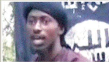
Abu Musab al-Barnawi ▲

Launched military operations in 2009 to create Islamic state – since then more than 20,000 people have been killed. Shekau continues to command militants under group's previous name, Jama'atu Ahlis Sunna Lidda'awati wal-Jihad (JAS)