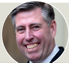
Sir Graham Brady

Tory backbench chief receives letters from 48 Conservative MPs calling for no-confidence vote in Prime Minister Theresa May