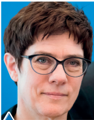
Annegret Kramp-Karrenbauer, 56:

German chancellor Angela Merkel – Europe's most powerful leader – has confirmed that she will not be running for re-election as party leader of the centre-right Christian Democratic Union (CDU)