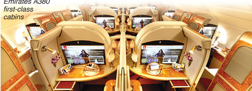
Emirates A380 first-class cabins

First-class air travel fell sharply as the 2008 financial crisis curbed corporate spending. A decade on, long-haul operators are reintroducing first-class cabins costing more than $10,000 for a round-trip ticket