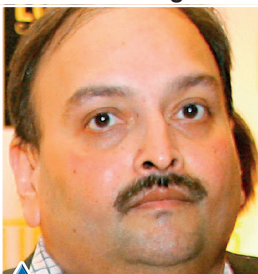
Mehul Choksi: Indian billionaire – wanted in connection with $2 billion fraud – is citizen of Antigua and Barbuda

More than a dozen countries sell “golden visas” to people willing to invest in a country’s economy under Citizenship by Investment Programmes (CIPs), raising some $3 billion a year