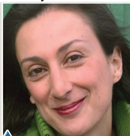
Daphne Caruana Galizia: Journalist assassinated last year while investigating Maltese government corruption

CIP minimum costs (all costs in U.S. dollars)