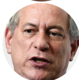
Ciro Gomes PDT