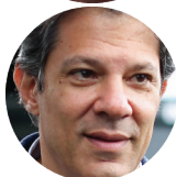
Fernando Haddad PT