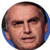
Jair Bolsonaro PSL