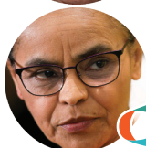
Marina Silva REDE