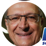
Geraldo Alckmin PSDB