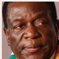
Emmerson Mnangagwa ZANU-PF