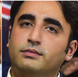
Bilawal Bhutto Zardari

Head of PML-N and brother of jailed former Prime Minister Nawaz Sharif , vowing to challenge results