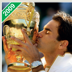
+ Andy Roddick 6 + Roger Federer 2