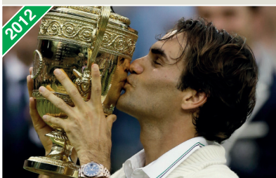
+ Roger Federer 3 + Andy Murray 4