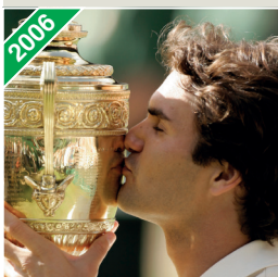
+ Roger Federer 1 + Rafael Nadal 2