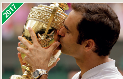
+ Marin Čilić 7 + Roger Federer 3