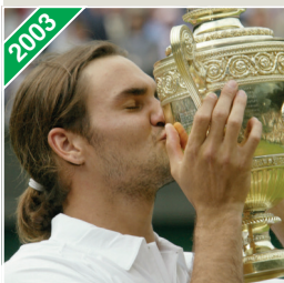
+ Roger Federer 4 + Mark Philippoussis

Seed entering championship 0 7 7 Tie-break after score of 6-6