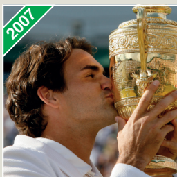
+ Roger Federer 1 + Rafael Nadal 2