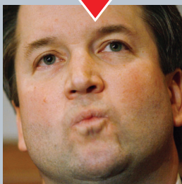
Brett Kavanaugh, 53 Appeals court judge for District of Columbia