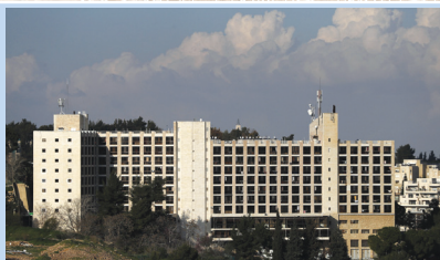
Former Diplomat Hotel, now part of U.S. consular compound in Arnona neighbourhood

Ambassador David Friedman's office will be located in consular section until new embassy building is erected in 2019