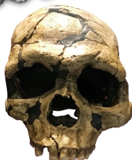
Qafzeh 6 fossil

Before Misliya-1, earliest modern human fossils found outside of Africa were those dated between 90,000 to 120,000 years old at Levantine sites of Skhul and Qafzeh