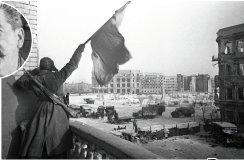
Victory flag raised over Stalingrad, Feb 1943

■ Aug 23: German 6th Army begins assault, supported by intense Luftwaffe air raids that leave much of city in ruins