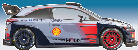
Hyundai i20: Andreas Mikkelsen, winner of 2016 Australia Rally, then driving for VW