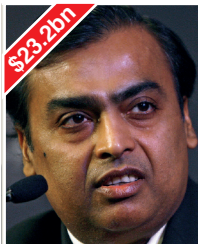
Mukesh Ambani Oil and gas India