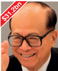
Li Ka-shing Diversified Hong Kong