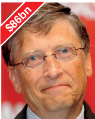
Bill Gates Microsoft United States

The wealth held by the world's 1,542 billionaires jumped by nearly $1 trillion* in 2016. Asia's economic expansion saw a new billionaire created every other day, with three in four living in China or India