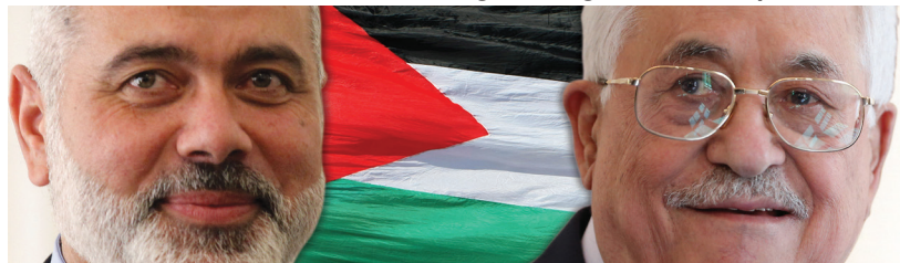
Ismail Haniyeh , Hamas leader

After a decade-long rift, rival Palestinian groups Hamas and Fatah have reached a preliminary agreement that could pave the way for President Mahmoud Abbas to resume governing the Gaza Strip