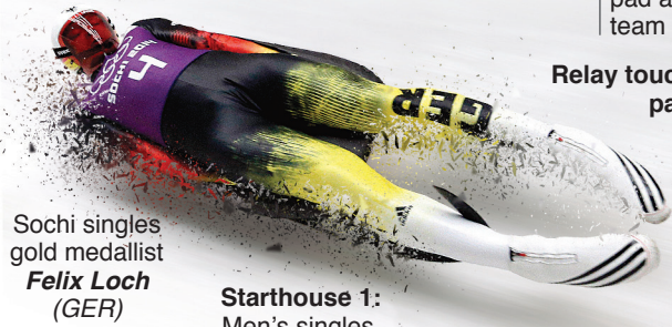
Sochi singles gold medallist Felix Loch (GER)

Singles men/women: Four runs over two days. Times tallied to determine winner Doubles: Two runs over one day. Teams almost always male, but female or mixed pair permitted Team relay: One female, one male, one doubles pair make one run each. When athlete hits touch pad at finish line next team member(s) starts