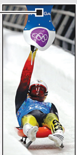
Relay touch pad