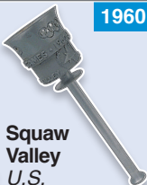
Squaw Valley U.S.