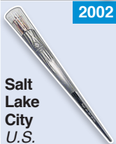
Salt Lake City U.S.