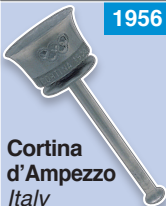
Cortina d'Ampezzo Italy