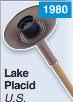
Lake Placid U.S.