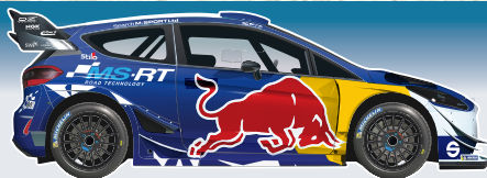
Ford Fiesta: Sebastien Ogier, winner of 2016 German Rally